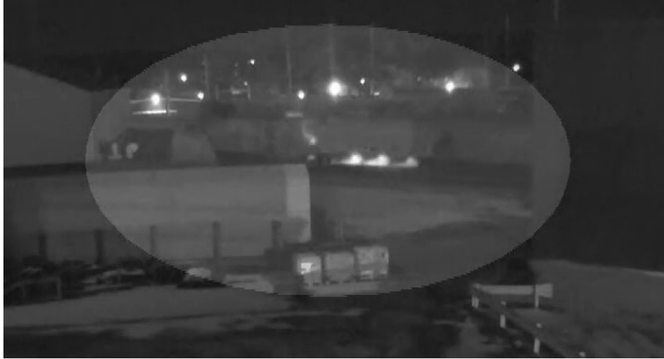
Still frame from surveillance video taken in Salem, Ohio - 20 miles away from the train derailment site.

115. On the Fort Wayne Line, NSC and NSRC had equipped their rail network with hotbox detectors to assess the temperature conditions of railcar wheel bearings while en route.